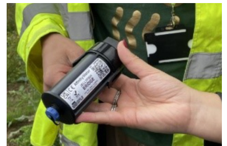
Smart Networks at Bidwell West