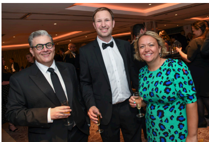
Project Zero Team are finalists!