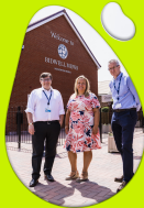
Bidwell behaviour analysis shows fantastic results!

Our Water Trading Platform is well underway